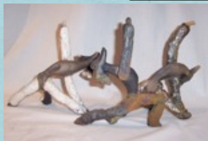
some of last years winners