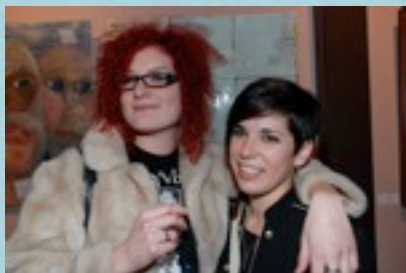
opening night 2010